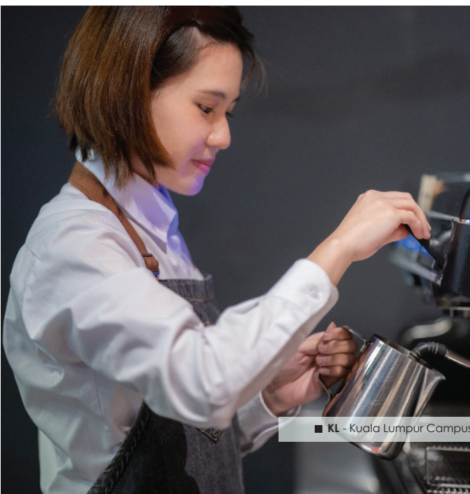
■ KL - Kuala Lumpur Campus

Partner universities for the Dual Award programmes may change from time to time to ensure the best value and quality is offered to students. Students are advised to obtain the latest information on Dual Award partner university for their programme from the Faculty.