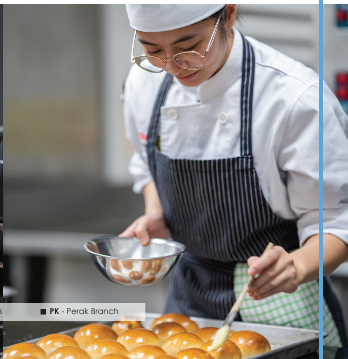
■ PK - Perak Branch